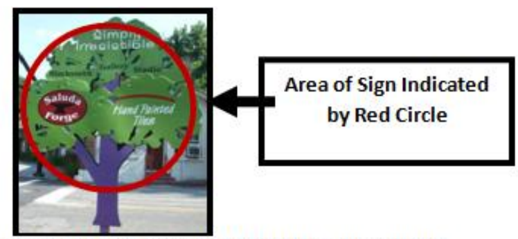
Example Illustrating Measurement of the Area of an Irregularly Shaped Sign

SIGN COPY. Any graphic design, letter, numeral, symbol, figure, device or other media used separately or in combination that is intended to advertise, identify or notify, including the panel or background on which such media is placed.