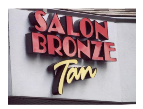
Example of Channel Lettering

CHANNEL LETTERING. A sign design technique involving the installation of three-dimensional lettering against a background, typically a sign face or building façade.